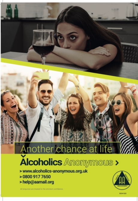
YP poster female 5034

Female version product number 5034 & Male version product number 5035. A 4 size only