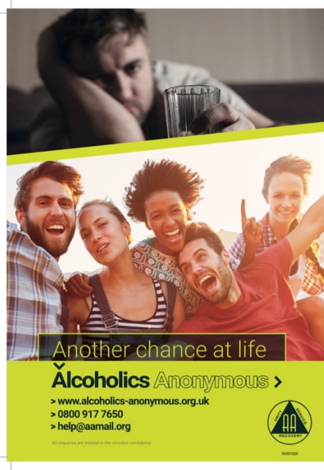
YP poster male 5035